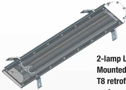
2-lamp LED Tube Corner Mounted Downlight with T8 retrofit tubes, pendant or surface mounted with vandal resistant lens